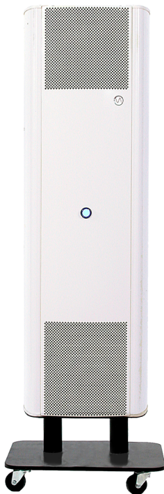
Wheeled model (-ST)

UV-FAN series includes a wide range of wall or wheeled (model -ST) purifiers, different according to the UV-C lamps power and size.