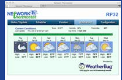
Quickly Make Adjustments Based on Your Needs