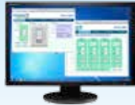
PC or Mac