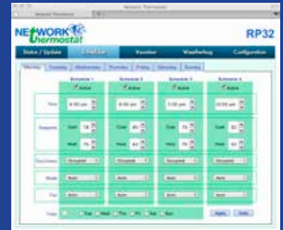
Simple Design for Intuitive Navigation