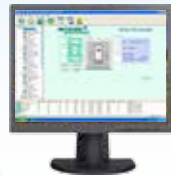
Net/X-IP Command Center PC Software