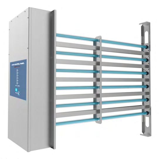
Model with synoptic LED