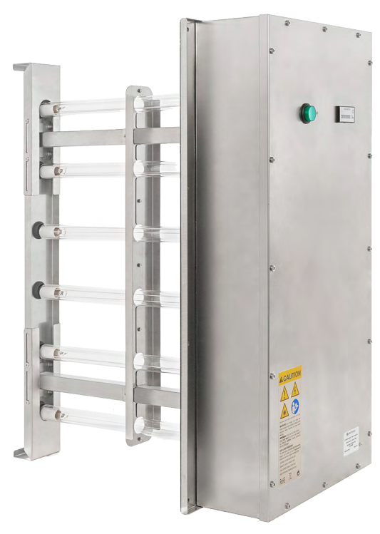
UL Listed model